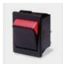
☐ C1550XL ---