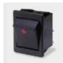
☐ C1553PL ---