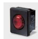
☐ C0480RA --- Shown with M614 bezel cover