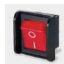
C1553AA with M616 guard Cut-out 22.0/22.1 x 29.4/29.5 Guard accepts "A" body only