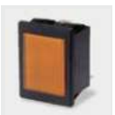
☐ C0480AL ---

Panel sealing washer W42 is available for the above body sizes. This reduces panel thickness by a further 1.00mm. Covers are not suitable for momentary types.