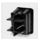
Optional snap-in M441 barrier