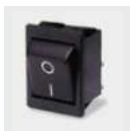
☐ C1350AL ---