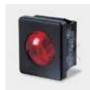
☐ C1553RA --- Shown with M614 bezel cover